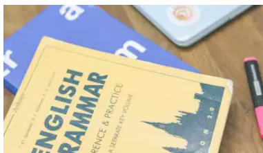
Kinds Of Nouns Worksheet January 2, 2021